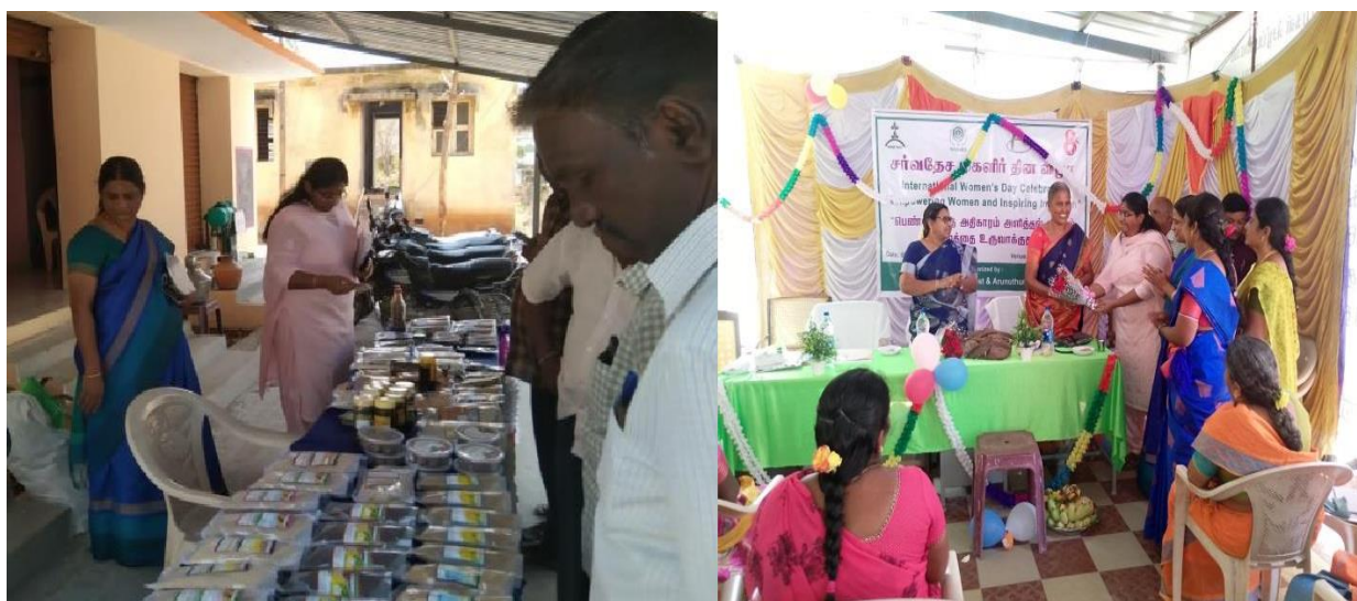
Celebration of international women day – Guest DDM NANBARD, Project Coordinator KVK, MD Central Cooperative Bank

The event concluded with the honouring of guests and community leaders, alongside a display of millet value-added products to promote awareness of the importance of cultivation, consumption, and commercialization for nutritional security. The meeting ended with a vote of thanks and the singing of the National Anthem.